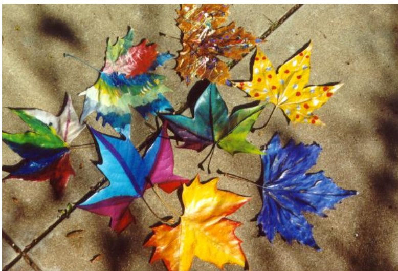
Autumn Leaves Revisited

'I was able to redirect my energy, which was all over the place into a positive creative flow, which calmed and centred myself.'