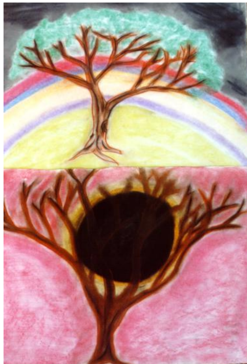
Oneself as a Tree

Finally, many clients chose to accept the symbolic and metaphoric images they created as part of themselves, and through creative expression came to understand some of the more hidden, elusive parts of themselves.