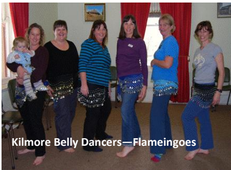
Kilmore Belly Dancers—Flameingoes

"The group offers support, love, friendship & best of all—laughter and fun" - Flameingoes