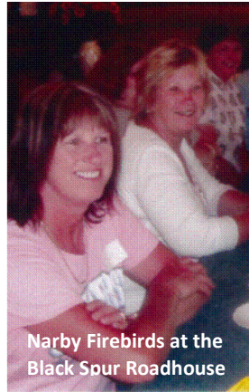
Narby Firebirds at the Black Spur Roadhouse